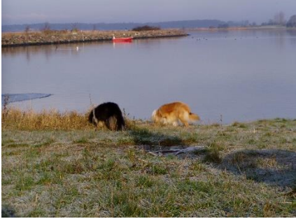
Well, home again. Now we have 4 shelties, one tricolour, one zabre and 2 blue puppies –