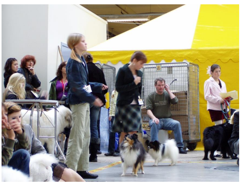
We reached Malmø and the puppyexhebition (puppies at max. age 12 month).

It took place at the Swedish Puppyexhebition in Malmø, Sweden. We could only bring Thea, the other dogs had to stay at home.