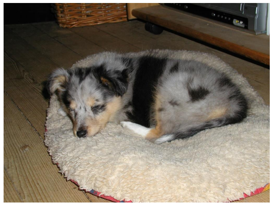
It's swell having a puppy. Josefine is a fast learner and she is at little bitch with a ferm temperament.